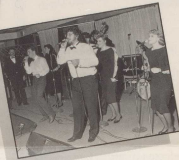
Soundwave performs for the VCC Alumni.