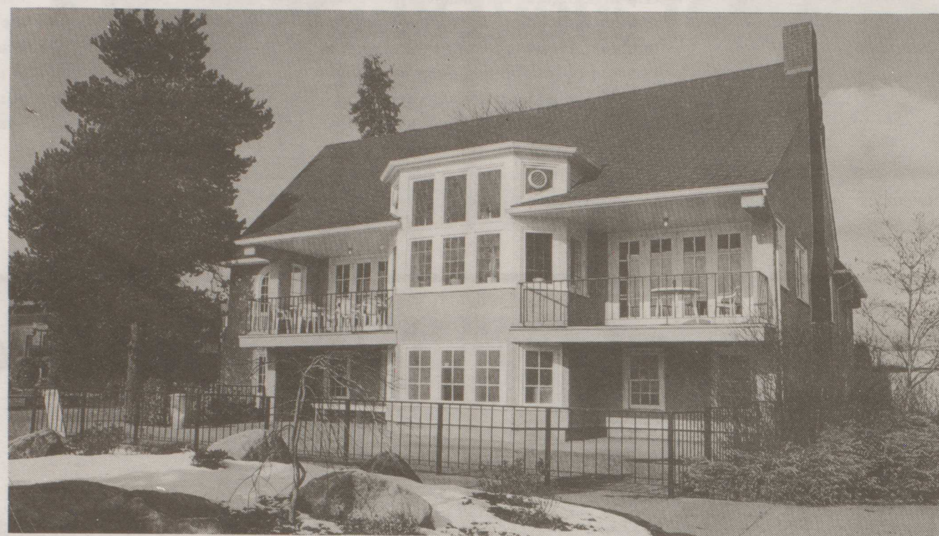
The future Langara Heritage Pavilion.

An ad hoc committee of the Langara Faculty Association has been working hard to make this preservation happen. We are interested in learning whether the building would be used by alumni, and what uses would be preferred. Could you take a few minutes of your time to indicate what your preferences are?