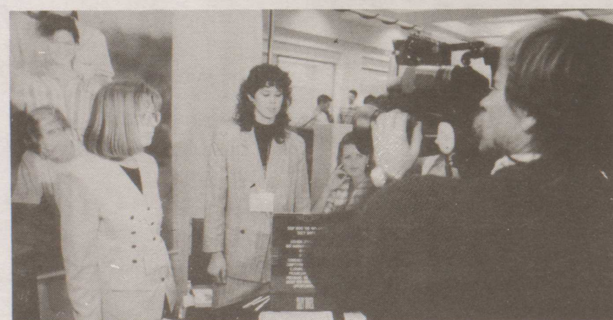
Scenes from the 1993 Alumni Association Career Fair at Langara.