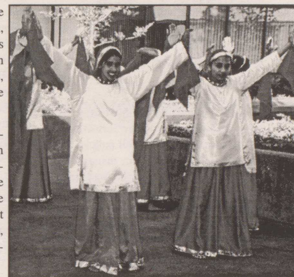
Multicultural dancing and music highlight CityFest '98.