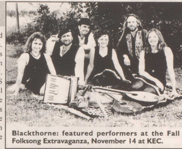
Blackthorne: featured performers at the Fall Folksong Extravaganza, November 14 at KEC.

British, Canadian and and Quebecois sources. Three Strong Winds will showcase Canadian songs, many by B.C. songwriters. The VFSS Shanty Crew will encourage the audience to join in sea shanties such as "What Shall We Do With The Drunken Sailor?" and "Blow The Man Down."