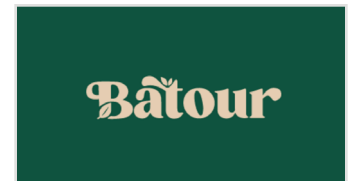
Above: Batour logo design Left: Mama's Hands recipe book layout design