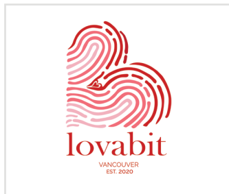
Top left: Lovabit logo design Bottom left: Lenz Dog Training logo