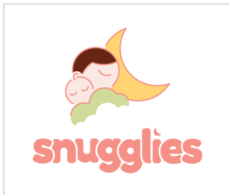
Above: Snugglies logo design and brand identity