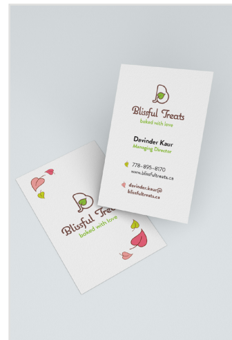
Above: Blissful Treats business cards Left: Ronald Macdonald House Garage illustration