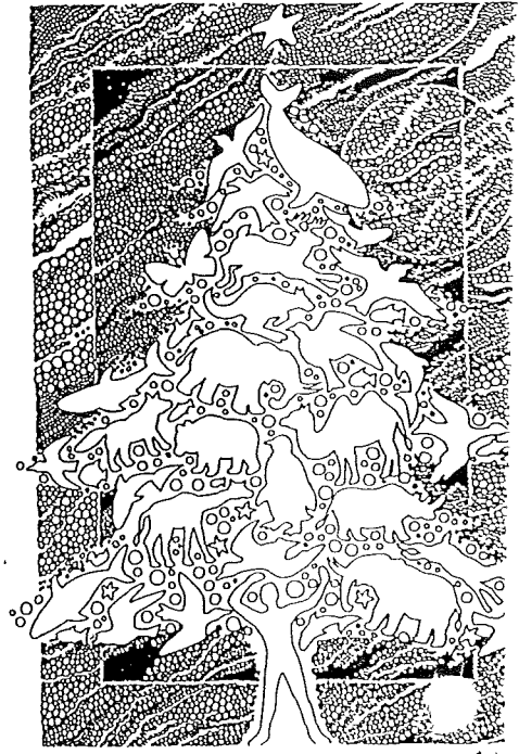
Tree of Life