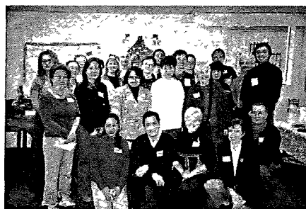
Above: Event Participants