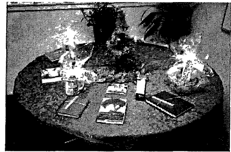
Above: Gifts donated by local businesses.

On behalf of our clients, staff at Network to Work, and the Vancouver Community College, I would like to acknowledge the tremendous support of the following businesses: