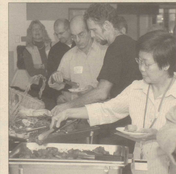
Above: Employees enjoy food while celebrating with colleagues.