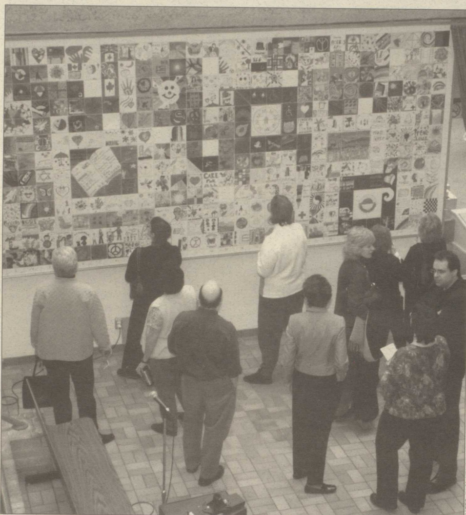
The VCC community admires the diversity tile wall at the City Centre campus unveiled in February.

M usic was in the air...and dance and art during the college's Diversity Awareness Week last month.