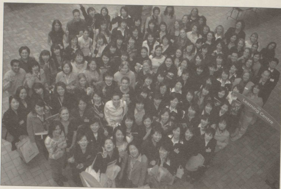
Dental Hygiene students from Miyagi and VCC come together to share information and culture last month.