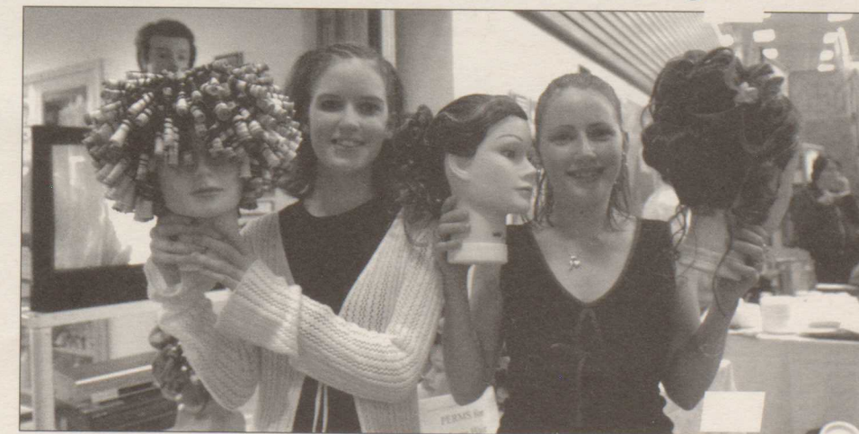
Above: Future hairstyling students enjoy the department's display while visiting VCC's Info Night on April 7.

Promotion for Information Night included advertising, direct mail and online initiatives targeted to key audiences that include potential students, parents and high school career counsellors. ☺