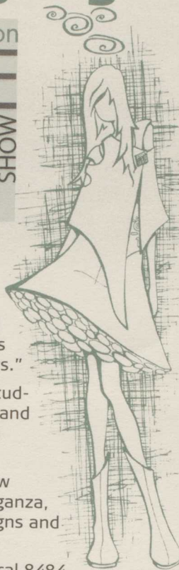
ART: V. McDONELL

let there be fashion FIAT MODE XVII FASHION SHOW