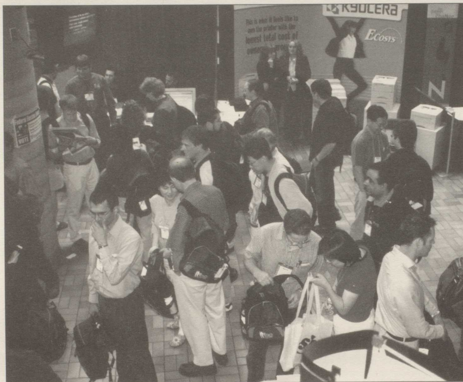
IT4BC participants gather in the main foyer at City Centre Campus while vendors set up their booths.

V CC hosted the fifth annual IT4BC Conference at City Centre campus earlier this month, drawing a record crowd of post-secondary IT professionals to the event.