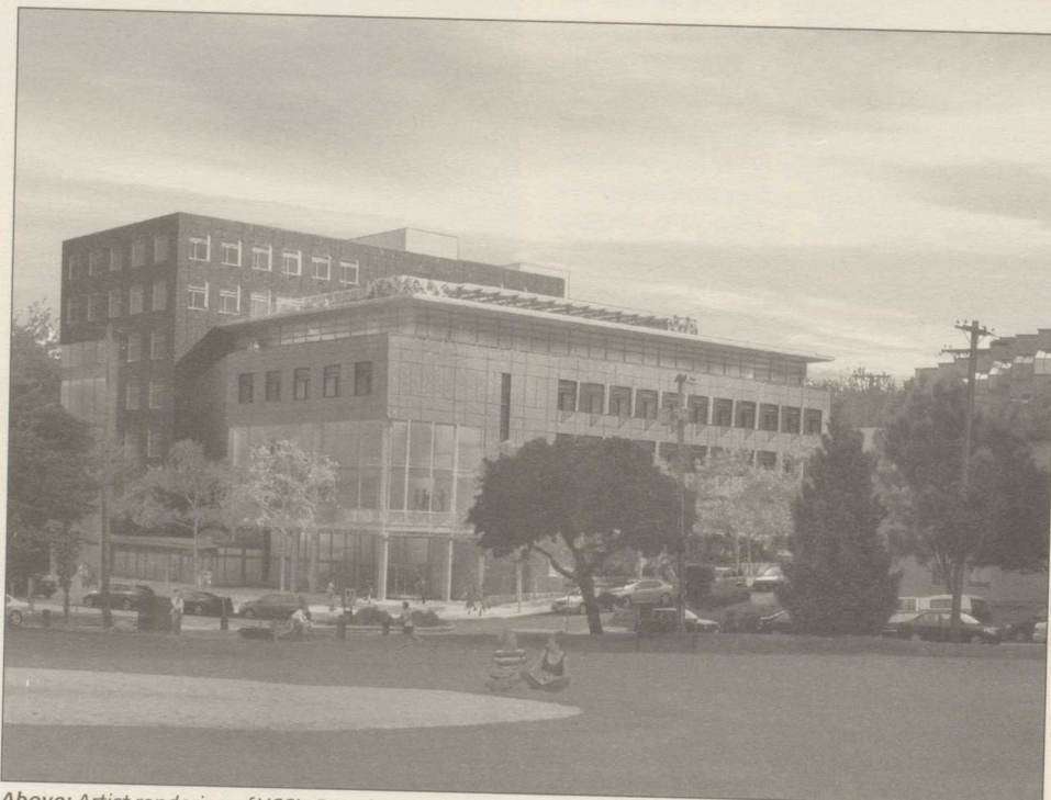
Above: Artist rendering of VCC's Broadway campus expansion when viewed from the park across the street.