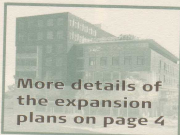
More details of the expansion plans on page 4

removing the building north of the campus loading bay – the day care facility is being relocated – and excavating the site; that's expected to run from early October through early December.