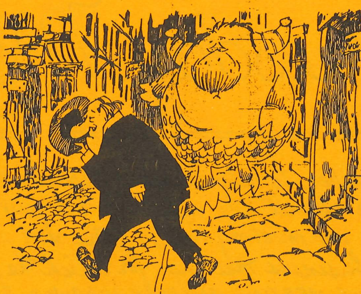
Avoiding A CONFRONTATION