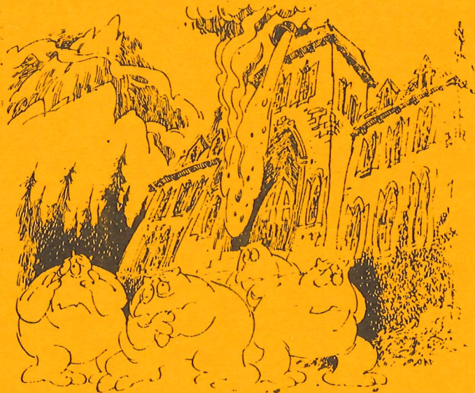
Pouring Oil On TROUBLED WATERS