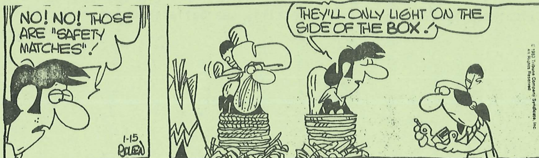
THE BORN TEACHER!