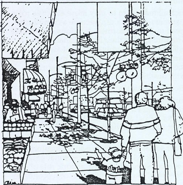
Artist's conception of a Mount Pleasant streetscape, with banners that residents and merchants can help design.