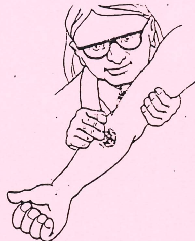
If the place where the test was given becomes raised and hard, the skin test is positive. This does not mean you have tuberculosis disease. It means you have been infected with the TB germ at one time.

WHERE - second level outside the security office