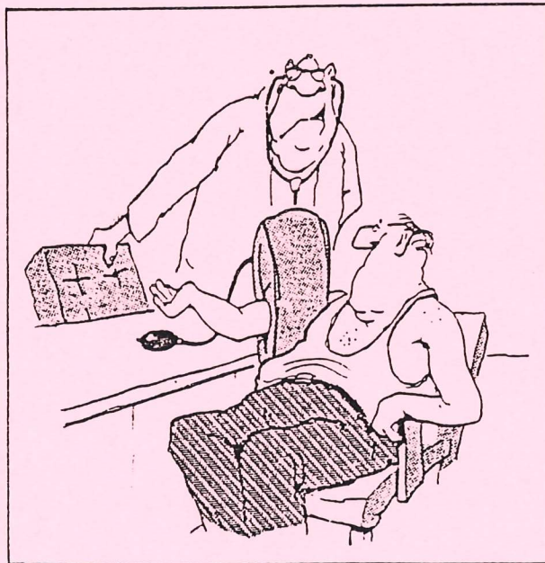
"Stay calm...I'm gonna get a second opinion on your blood pressure."

FIND OUT MORE ABOUT HIGH BLOOD PRESSURE AND THE RISK FACTORS FOR HIGH BLOOD PRESSURE AND HEART DISEASE.