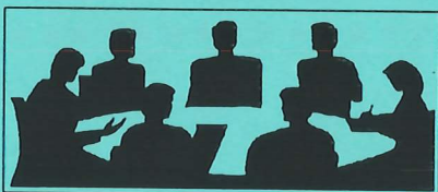
At the Meeting

Minutes have been mailed to one address but have reached all members of the group