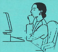
Reading the minutes

Minutes have been mailed to one address but have reached all members of the group