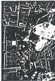
Seminars are free and are repeated over the 3 days of the Show.