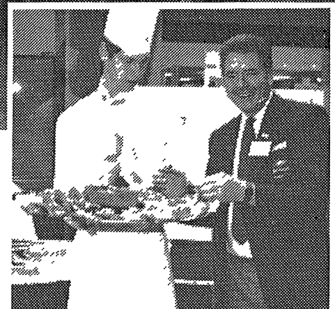
Students, faculty and staff celebrate the opening of the new Centre as Minister of Tourism Bill Reid (lower right) samples the delicacies.